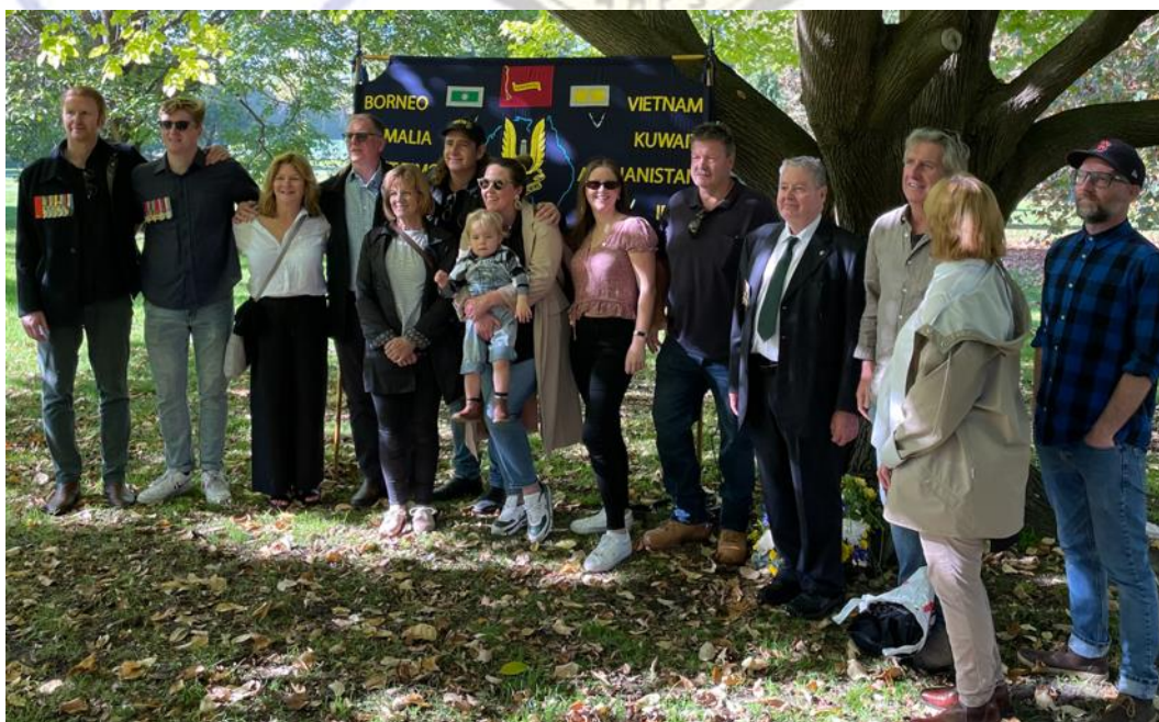
Families and friends of the ASASA