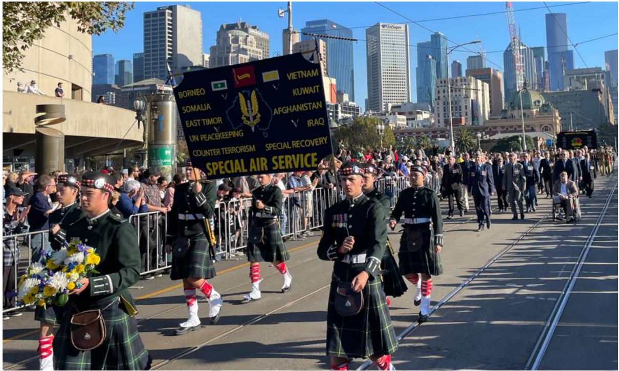
Scotch College lads with our Banner setting off down Swanston St