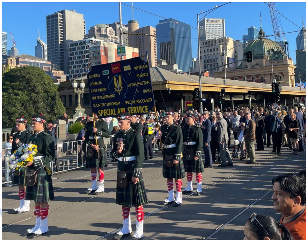
Scotch College Cadets escorting our banner