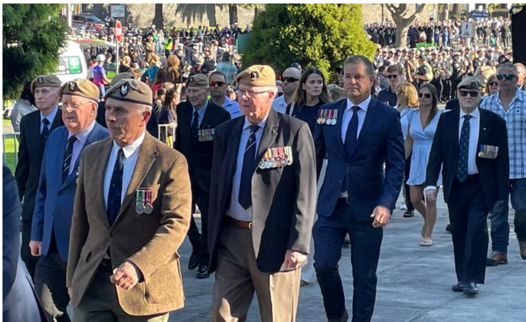
Marching up to the Shrine forecourt