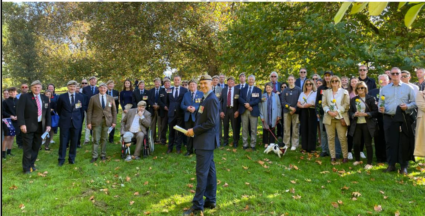
The service by our plaque at our tree