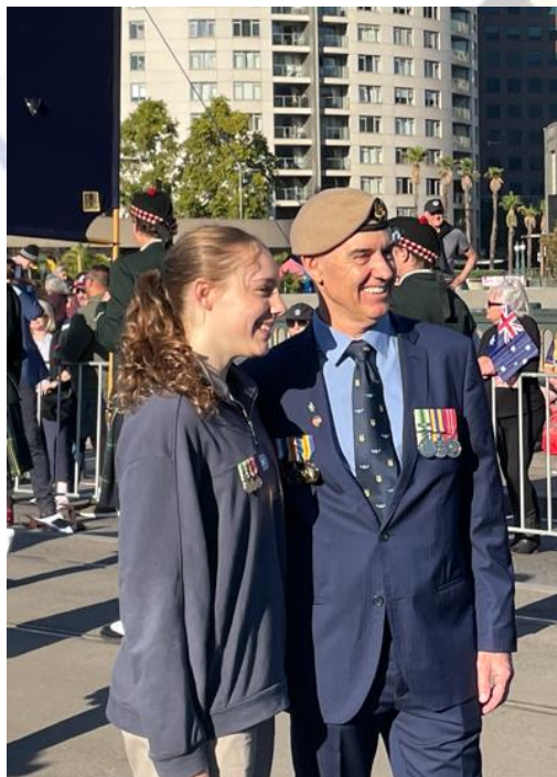
Caity (Ash's daughter) & Ash