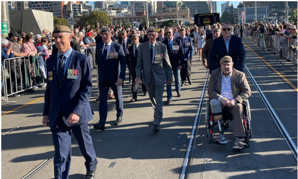
The ensemble in Swanston St